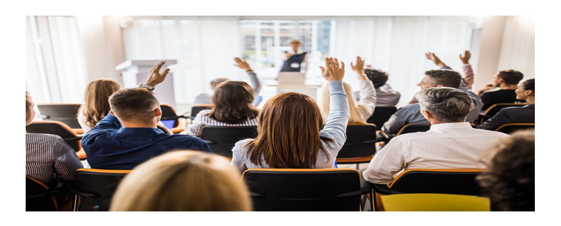
Expert SPEAKERS presenting at the ILETA Hybrid Conference - Bologna 2024 include: -